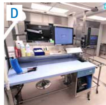
Inspection and packaging of instruments