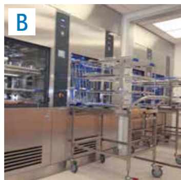
Machine cleaning and disinfection