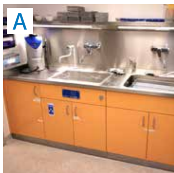
Manual pre-cleaning incl. ultrasound